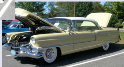
Peoples Choice winner 1955 Coupe de Ville